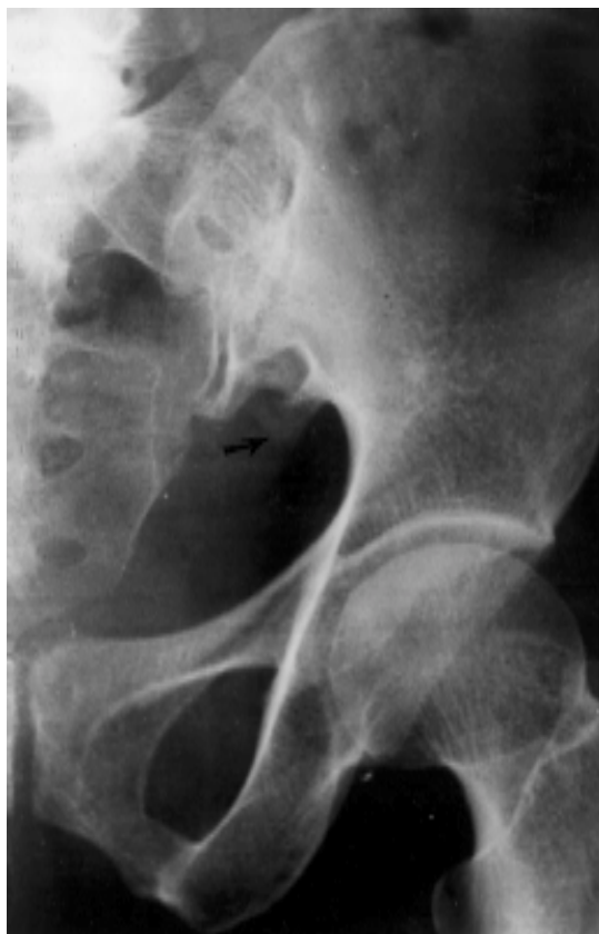
◀ Figure 2 Anteroposterior radiograph of the sacroiliac joint showing the osteophyte at its inferior margin.