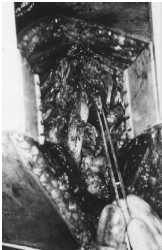
Figure 3 Intraoperative view showing the osteophyte (held by forceps) that was impinging on the sciatic nerve.