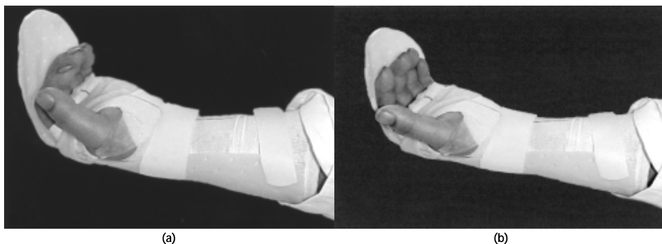
Figure 1 Mobilisation of the fingers while wearing a dorsal splint: (a) gentle flexion and (b) gentle extension of the fingers.

Tendons were repaired by the modified Kessler's method using a 2-strand core suture with 4/0 nylon and a circumferential running suture with 6/0 nylon. Both superficialis and profundus tendons were repaired and the flexor tendon sheath repaired if feasible. A compression dressing was applied for 2 days together with a dorsal plaster slab to maintain the wrist in 40° flexion and extension block of the metacarpophalangeal joints at 90°. The hand was elevated. On the third postoperative day, the compression dressing was removed and, if wound healing was uncomplicated, a light dressing was applied. A thermoplastic dorsal splint was used to maintain the wrist in 40° flexion, the metacarpophalangeal joints at 70° flexion and dorsal extension block for the fingers at 0°. The fingers were unobstructed and able to move freely (Fig. 1). An extension platform support to the fingers was usually given at night to support and immobilise the interphalangeal joints in extension.