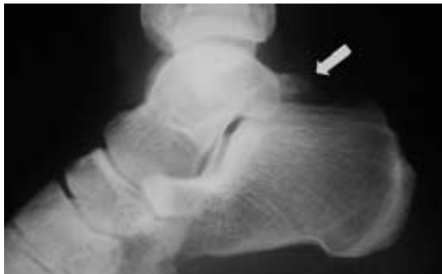
Figure 1 Lateral radiograph of the left ankle showing an os trigonum (arrow) with no osseous pathology.

rare. 3 Axial computed tomographic (CT) scanning is helpful for differentiating between true talar fractures and an os trigonum. A missed diagnosis can make the pathologies more complex and successful treatment more difficult. We report an unusual case in which a fracture of the os trigonum was observed.