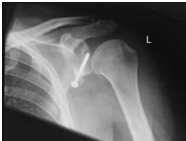
Figure 2 Postoperative radiograph after the Bristow-Latarjet repair (at 43 months).

The operation entailed a standard axillary incision, thereafter the processus coracoideus was exposed and the musculocutaneous nerve protected. A central drill hole was placed in the coracoid tip using a 3.2-mm drill to facilitate fixation. An osteotomy of the coracoid was performed approximately 1.5 cm proximal to the tip. It is of major importance to keep the insertion of the tendon of the pectoralis at the base of the coracoid process. With the arm in external rotation, the tendon of the subscapularis was vertically