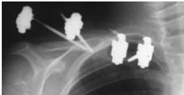
Figure 4 Postoperative radiograph showing the external fixation of the clavicle.

Congenital pseudarthrosis of the clavicle appears as a painless prominence lateral to the middle of the clavicle at birth or in early neonatal life. 1,4,7,9 At the site of the pseudarthrosis, the ends of the clavicular segments are enlarged and there is a degree of motion between them. 4,5 The deformity tends to become more obvious as the child grows and marked mobility is found at the site of the pseudarthrosis. 1,3-5,10 The skin