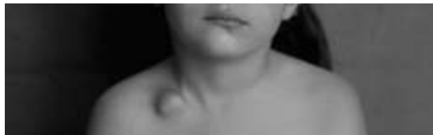
Figure 1 A 6-year-old girl with 2.5-cm prominence between the middle and distal third of the right clavicle.